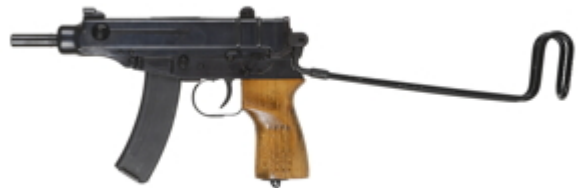
left view, stock extended