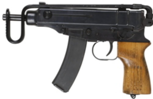
left view, stock retracted