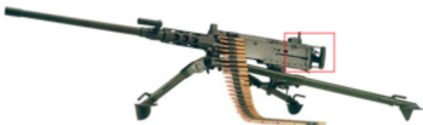
Type: Browning M2HB-QCB

left view, Browning M2HB-QCB air-cooled machine gun of current manufacture with quick-change barrel, on M3 tripod