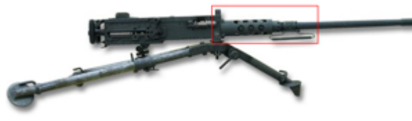
Type: Browning M2HB

right view, Browning M2HB air-cooled machine gun on M3 tripod