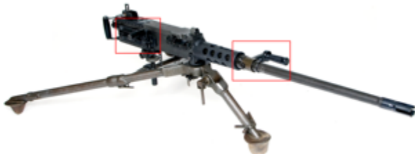
Type: Browning M2E2

weapon specifics, Browning M2E2 new Browning modification with quick-change barrel