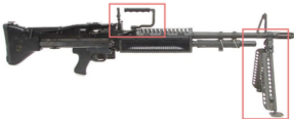
right view, on integral bipod