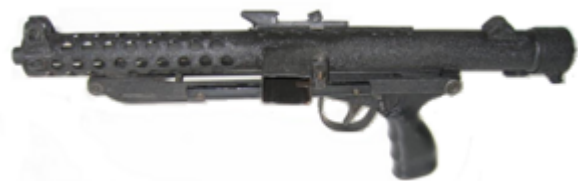
left view, ESP, submachine gun, 9 x 23 mm Largo