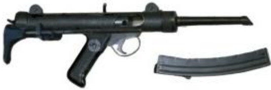
Type: FAMAE PAF 9 mm

right view, Chilean copy of the Sterling submachine gun with external differences such as retractable wire stock and missing barrel shroud