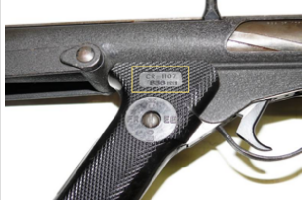
Sterling MP L2A3