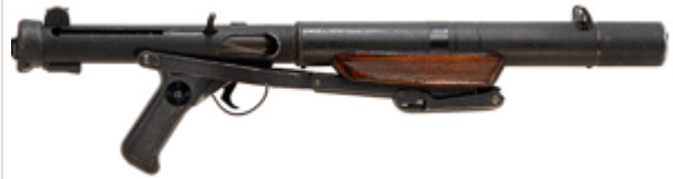
Suppressed version L34A1

right view, Chilean copy of the Sterling submachine gun with external differences such as retractable wire stock and missing barrel shroud