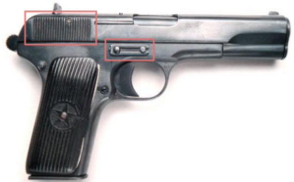
weapon specifics: post-WWII manufacture