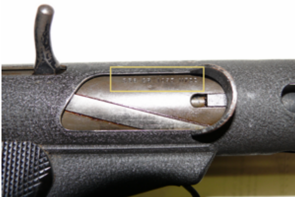
Sterling MP L2A3