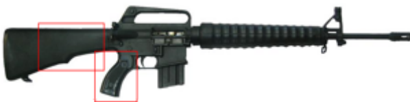
Type: NORINCO CQ (CHN)

right view. The TERAB rifle is a clone of the Norinco CQ manufactured by the MIC (Military Industry Corporation) of Sudan. The ARMADA rifle is a clone of the Norinco CQ manufactured by S.A.M. - Shooter's Arms Manufacturing, a.k.a. Shooter's Arms Guns & Ammo Corporation, in the Philippines.