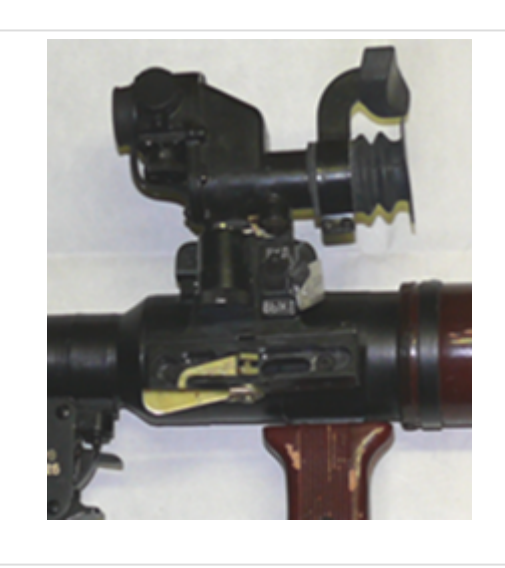
Type: RPG-7D anti-tank grenade launcher