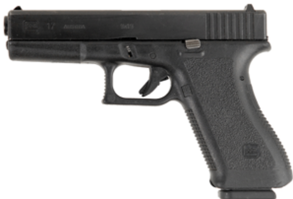
Generation 2 Glock 17

Generation 2 Glock 17, this model added finger stepping and cuts to the backstrap of the frame to make it easier to hold than the Generation 1 model.