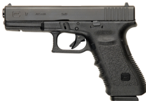
Generation 3 Glock 17

Generation 3 Glock 17, with finger grooves, thumb reliefs, and accessory rail on the frame, which differentiate it from the older model.