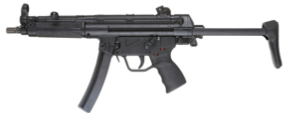
left view, stock extended