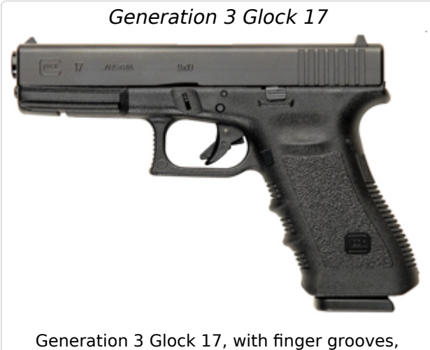
thumb reliefs, and accessory rail on the frame, which differentiate it from the older model.