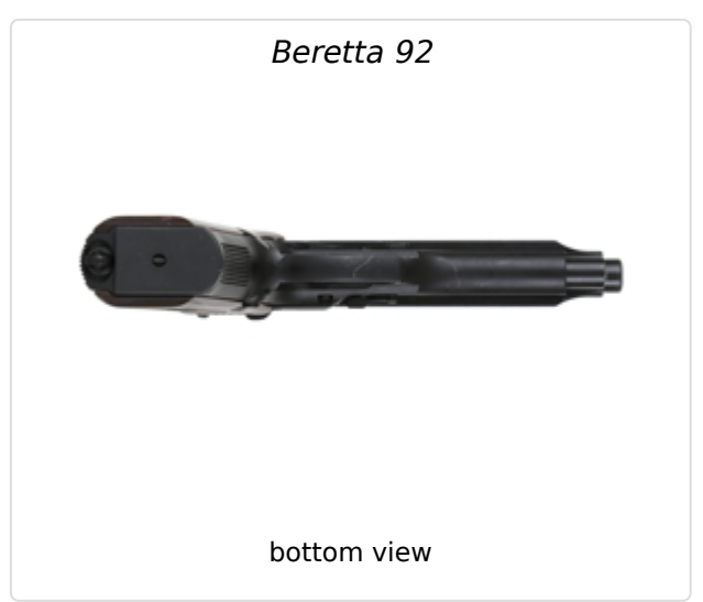
Beretta 92 090/md-01-300w.jpeg

marking details: Pietro Beretta Gardonne V.T. -Made in Italy. PB. C61066Z