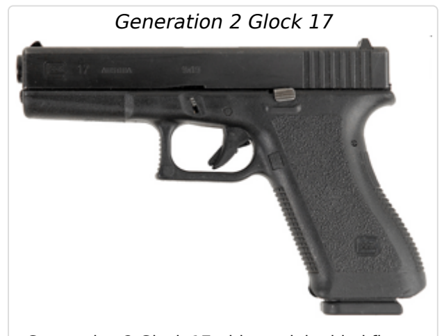
Generation 2 Glock 17, this model added finger stepping and cuts to the backstrap of the frame to make it easier to hold than the Generation 1 model.